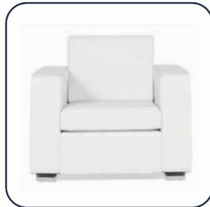
FE-6 Single Seat Sofa INR 2000/=