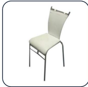
FE-2 Exhibitor Chair (White) INR 800/=