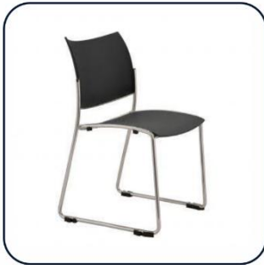
FE-1 Exhibitor Chair INR 600/=