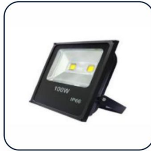
FE-18 LED Light 150W INR 2000/=