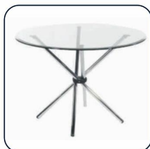
FE-10 Glass Round Table INR 1500/=