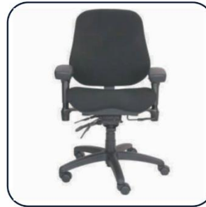
FE-3 Revolving Chair INR 1500/=