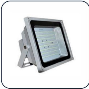
FE-17 LED Light 100W INR 1500/=