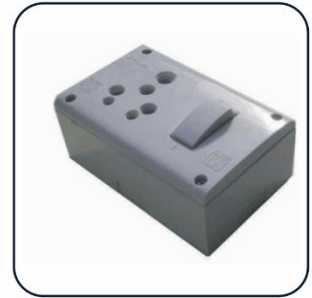
FE-20 Power Socket INR 800/=