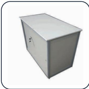
FE-9 Lockable Counter INR 1800/=