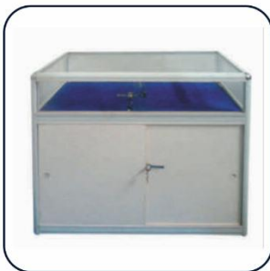
FE-13 Small Showcase INR 4000/=