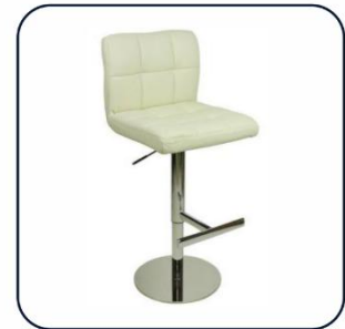
FE-4 White Bar Stool INR 1200/=