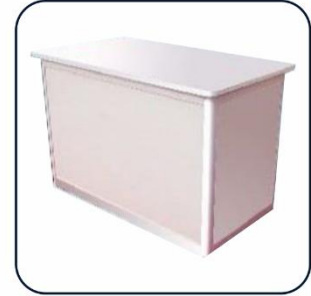
FE-8 Information Counter INR 1200/=