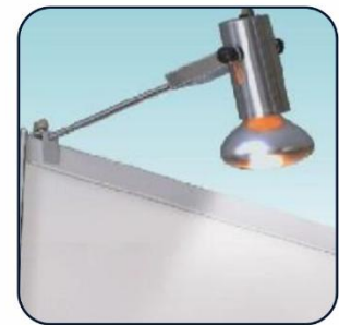
FE-16 Spot Light INR 600/=