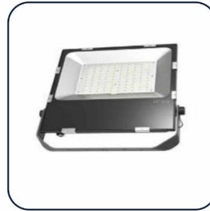
FE-19 Metal Halide 400W INR 2500/=