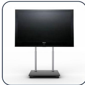
FE-22 Plasma TV 55" INR 10000/=