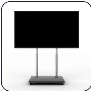
FE-21 LED TV 42" INR 5500/=