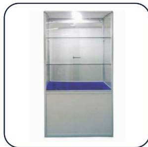
FE-14 Vertical Showcase INR 6000/=