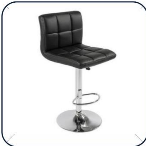
FE-5 Black Bar Stool INR 1200/=