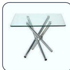
FE-11 Central Glass Table INR 1000/=