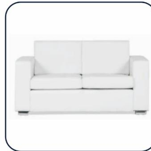
FE-7 Double Seat Sofa INR 4000/=