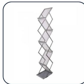
FE-15 Brochure Stand INR 1500/=