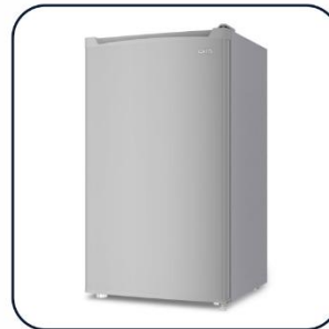
FE-23 Fridge - 90 Ltrs INR 6000/=