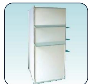
FE-12 Glass Shelf INR 700/=