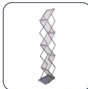
FE-15 Brochure Stand INR 1500/=