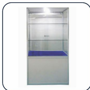
FE-14 Vertical Showcase INR 6000/=