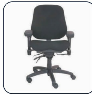
FE-3 Revolving Chair INR 1500/=