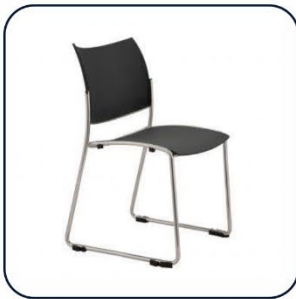
FE-1 Exhibitor Chair INR 600/=