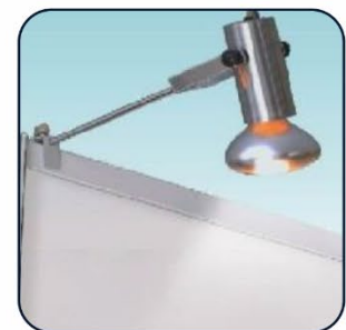
FE-16 Spot Light INR 600/=