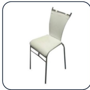
FE-2 Exhibitor Chair (White) INR 800/=