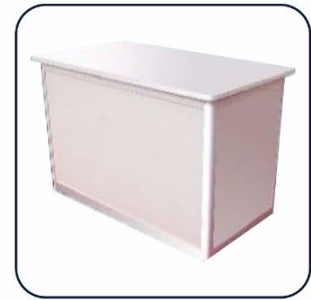
FE-8 Information Counter INR 1200/=